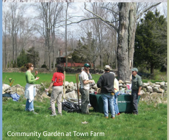
Community Garden at Town Farm