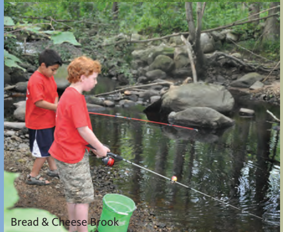
Bread & Cheese Brook