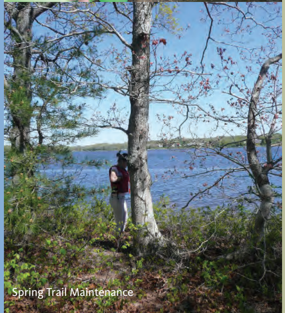
Spring Trail Maintenance